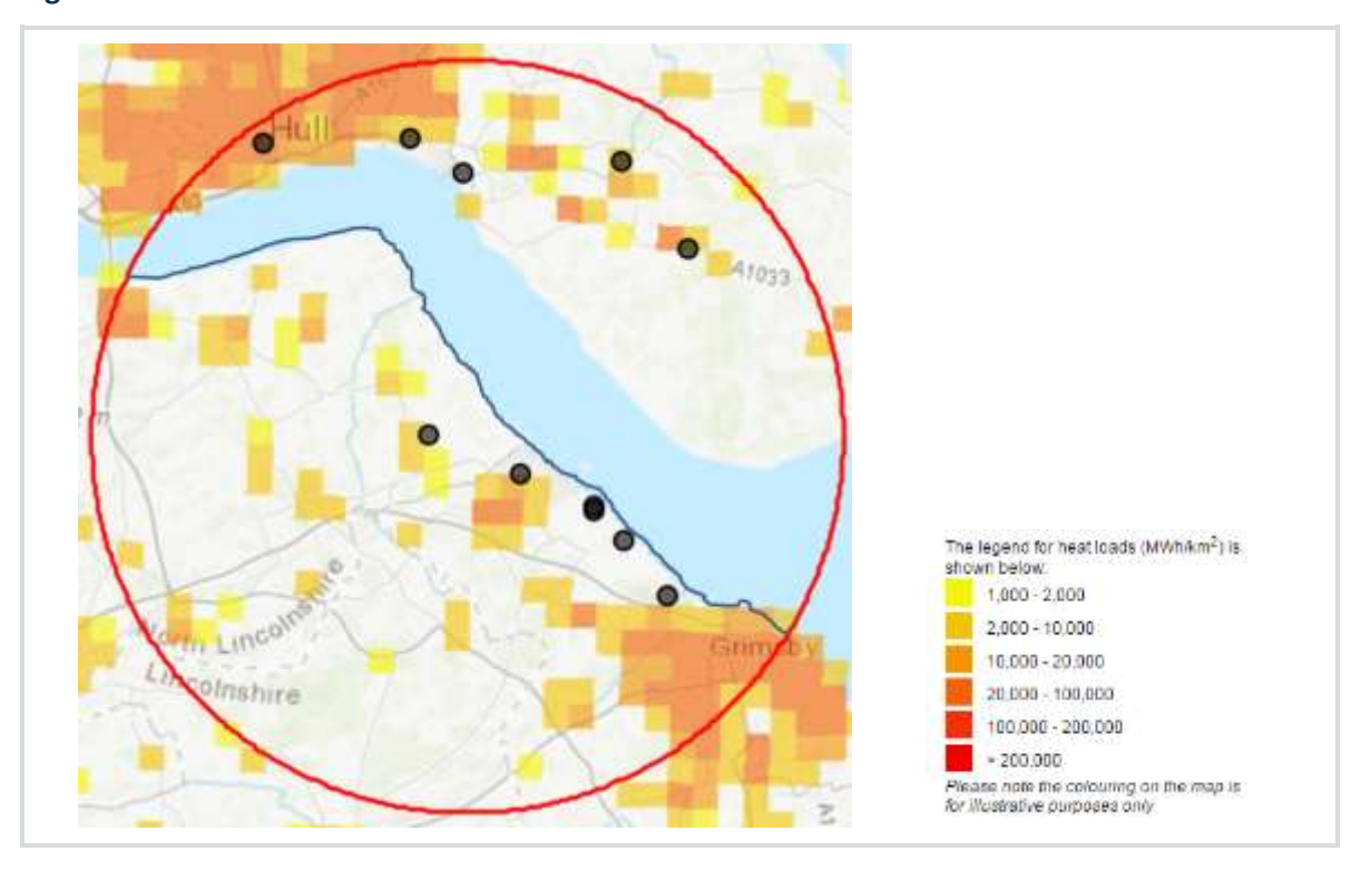
Figure 4.3: Domestic Heat Loads

4.2.7 In terms of the domestic heat loads within the CHP search area, the results from the UK CHP Development Map are shown in Figure 4.3.